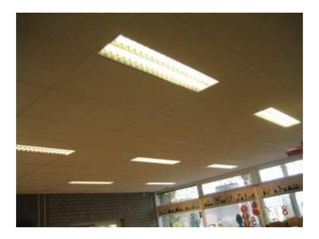
Figure 1. Conventional lighting system in the control school/classroom and the experimental school/classroom (pretest)